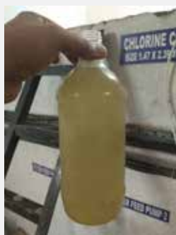
Incomplete degradation of sewage organics