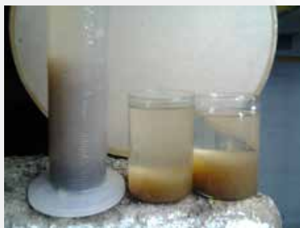
Effective sewage treatment process with BioKlearST