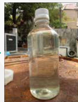
Clear, odor free, pathogen free water